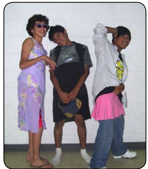
Some of the boys are getting excited about joining the S.M.A.R.T. Girls program, too.